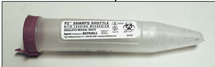
The P2 Sharps Shuttle

Preliminary evidence indicates that the shuttles were filled beyond the recommended, single use, capacity with needles and syringes causing a needle to puncture the bottom of the containers and sticking the member.